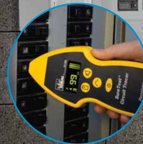
In Breaker Mode, receiver identifies the correct circuit to which the transmitter is connected.