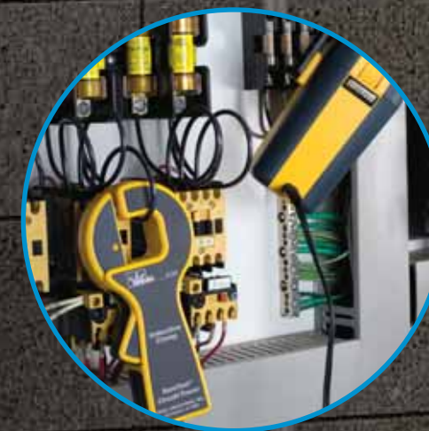
Inductive clamp allows you to induce a tracer signal on to the cable without affecting the low voltage signals on the circuit.