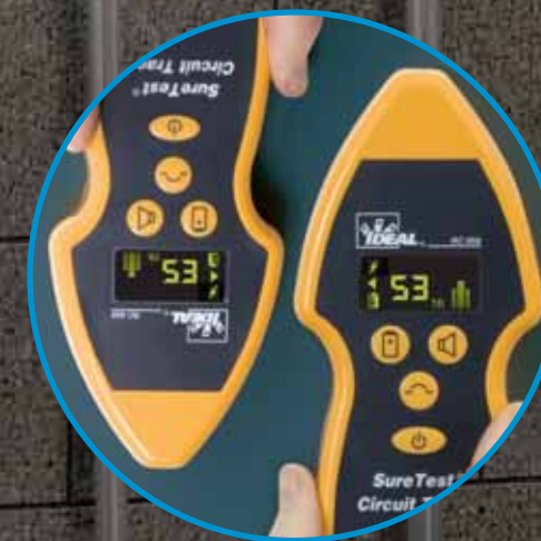
Revolutionary technology in the SureTest 958 rotates the display in 90° increments so that you always receive an upright reading. Even when the receiver is pointing down, you can keep up.