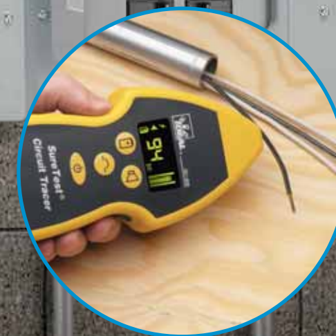
Individual wires can be sorted, opens can be located and shorts can be isolated.