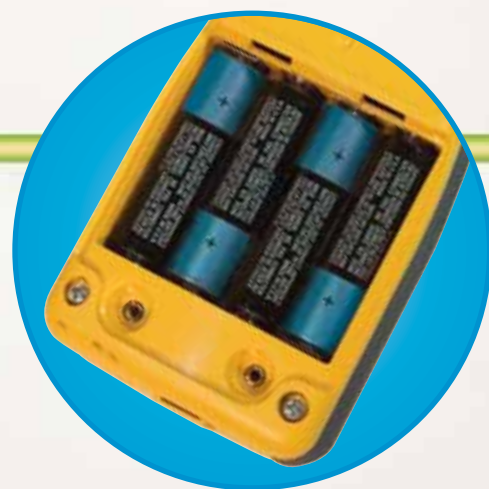
AA batteries give both the transmitter and receiver 4x the tracing power.