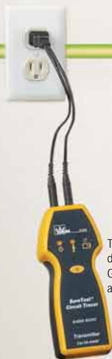
Transmitter will work on a de-energized circuit and won't affect GFCIs and sensitive equipment on an energized circuit.